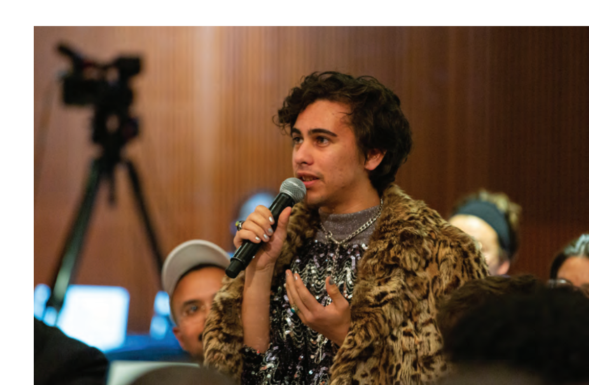
Audience member at Decade of Fire: Stay, Fight, Build on November 11, 2019.